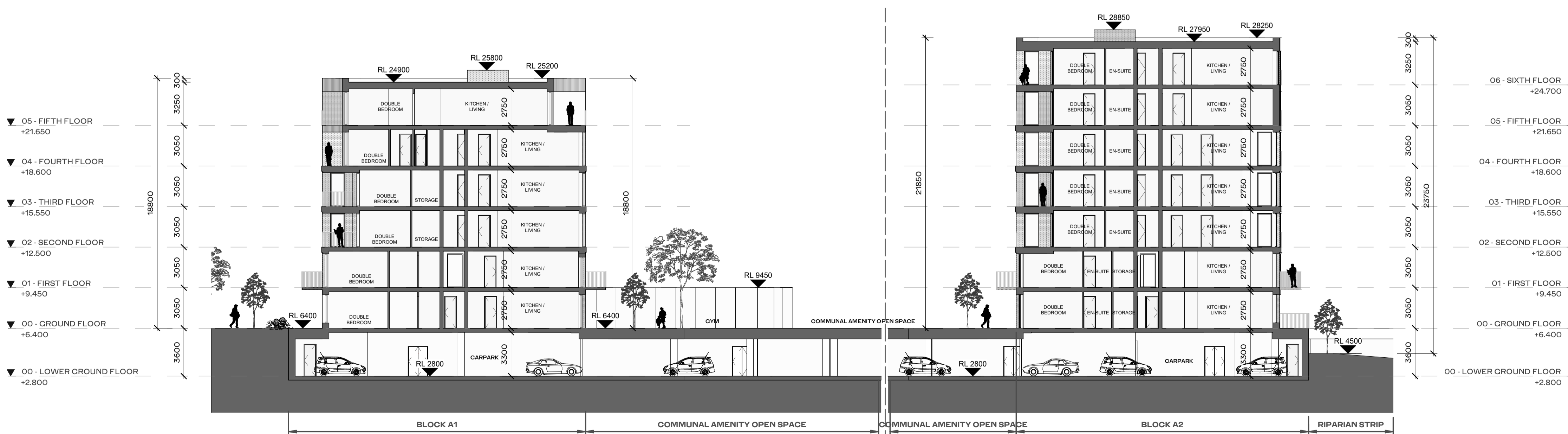
2 BLOCK A - SECTION 02-A1 1:200

ALL APARTMENT TYPES SHOULD BE READ IN CONJUNCTION WITH DRAWING NO.S P1601, P1602, P1603, P1604 AND HOUSING QUALITY